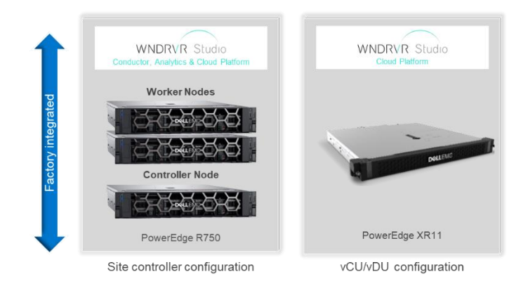
Dell Telecom Infrastructure Blocks for Wind River

Our first Infrastructure Blocks are based on Wind River Studio. Dell Technologies and Wind River are committed to helping CSPs build the cloud-native networks of the future. As part of that commitment, we have integrated PowerEdge servers, Bare Metal Orchestrator management software and Wind River Studio into a seamless hardware/software solution that simplifies the deployment and lifecycle management of a telco cloud at scale. The first use cases supported include virtual Centralized and Distributed Units (vCU/vDU) for vRAN and Open RAN and management clusters for the Telecom Multi-Cloud Foundation site controller, with more to come in the future.